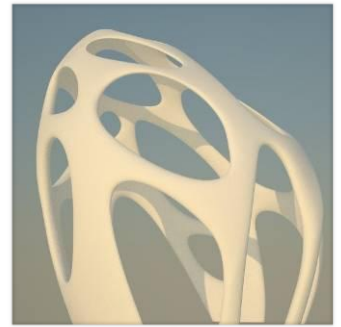
Gazebo design for RM manufacture using the Ceramic Monolite process