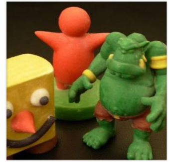
Computer games figures produced in Ceramic using 3D printing technology